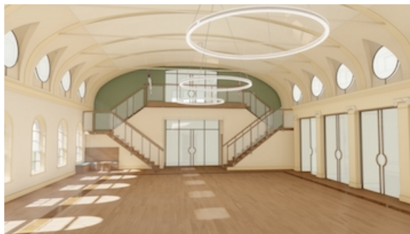
Above: A double staircase frames office entrances, hiding storage underneath. Doors provide soundproofing and privacy. Below: The lowered stage makes the room look larger. Curved steps invite easy access.

It is great testimony to Central's intrepid team – experts in architecture, preserva-