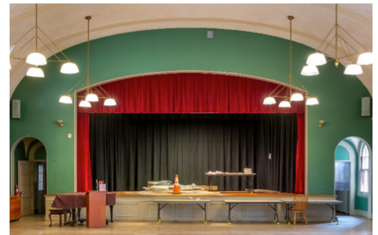
Chapel Hall stage before construction (above) and a rendering of how it will appear after (below)

Look for regular updates on Chapel Hall construction as well as the capital campaign in upcoming issues of the "Central Window" newsletter, on the church web-