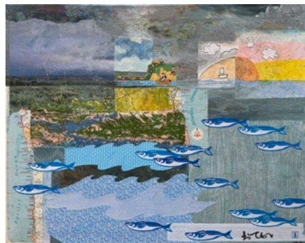
“Take-Out Seafood” by Claire Bowen

“Hometown Perspectives” invites you to explore a deeply rooted, regionally grounded – yet broadly resonant – vision of land, memory, community, and transforma-